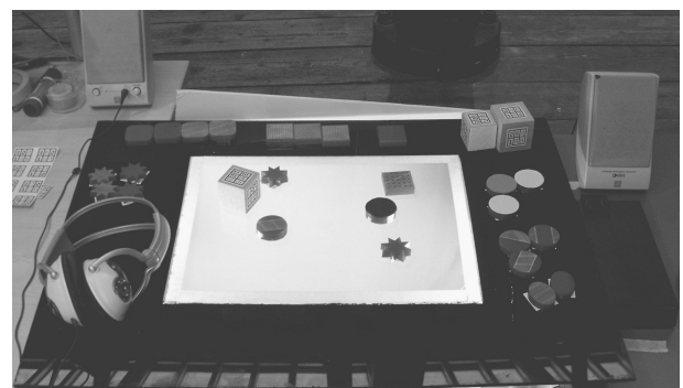
Figure 2: the reacTable* prototype

BlockJam (Newton-Dunn et al., 2003) uses, unlike the previously listed instruments, a set of sophisticated synthesis objects, which in this case aren't simply proxies for virtual processing elements, but do actually carry the necessary circuits for sound processing within. Basically, they are square boxes with simple plugs on the edges, which allow the assembling of physical sound processing patches. The boxes also come with a small LED display array to provide visual feedback on the object's state, and a touch-sensitive controller to program the object's behavior using a dial gesture.