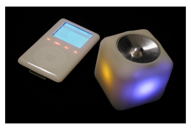
Figure 2. The Apple iPod and MusicCube prototype.

A specially designed side-up sensor consisting of four two-way infrareds combined with a ball bearing and a